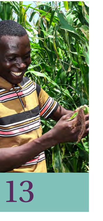
Food security & improved livelihoods