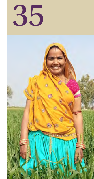
Foundation governance & financial information