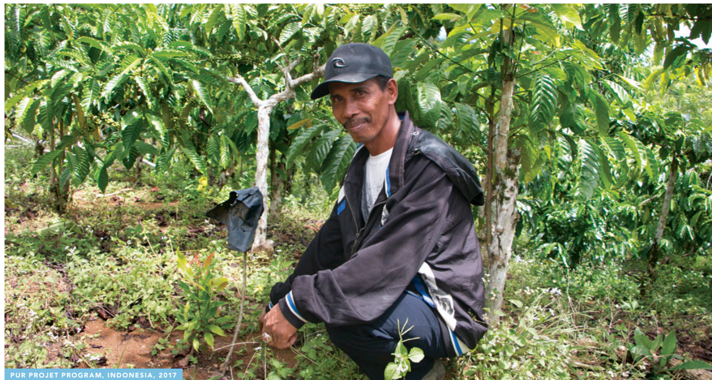
PUR PROJET PROGRAM, INDONESIA, 2017