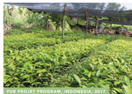
PUR PROJÉT PROGRAM, INDONESIA, 2017

In the Uttarakhand region of northern INDIA , farmers are faced with failing crops, the disappearance of traditional nutritious crops and increasingly unpredictable rainfall patterns due to climate change, leading to poverty and poor health among the local population. The Energy and Resources Institute's (TERI) program with the Foundation, as previously mentioned, also focuses on providing sustainable environmental solutions. By working to maintain the indigenous seeds' gene pool, it creates the conditions for autonomous agriculture while ensuring nutritious crops are more widely cultivated. Improved access to water is another key area of focus, through the identification and construction of innovative, low-cost water-sourcing and storage solutions.