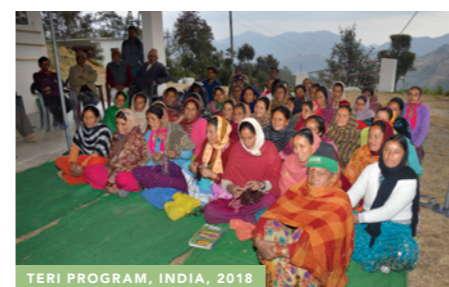
TERI PROGRAM, INDIA, 2018

+30% INCREASE in land dedicated to highly nutritious crops through our program in India