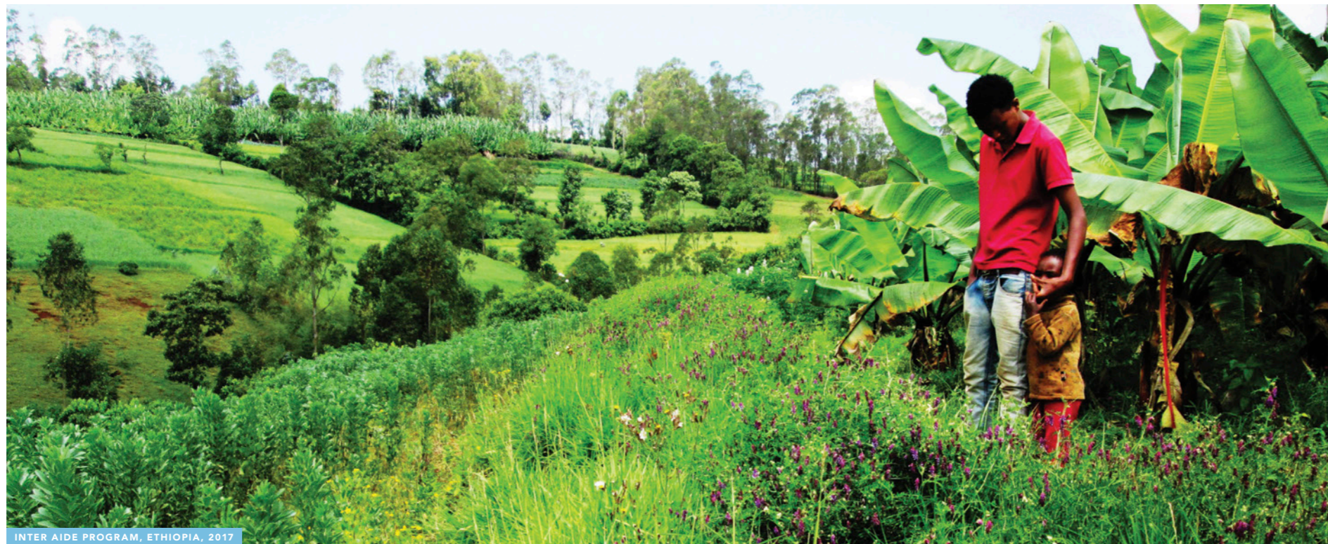
INTER AIDE PROGRAM, ETHIOPIA, 2017

In selecting partners, the Foundation will continue to work alongside those demonstrating expertise, reliability, local presence and the ability to utilize local resources, a proven track-record in managing projects related to food security, as well as strong ethics and values aligned with those of both LDC and the Foundation.