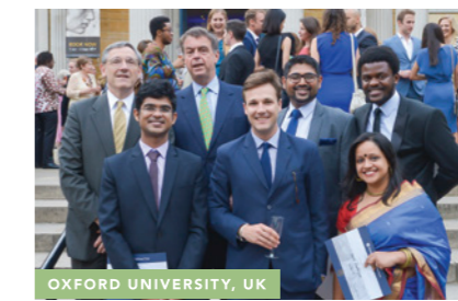
OXFORD UNIVERSITY, UK

In 2012, the Louis Dreyfus Foundation began its partnership with the Weidenfeld-Hoffmann Trust to fund scholars in business, law, research, education, health and political studies. Coming from various backgrounds and countries across the developing world, these students graduate in fields often closely aligned with the activities of the Foundation, with the potential to drive sustainable development in their respective countries. Some of the areas are outlined below: