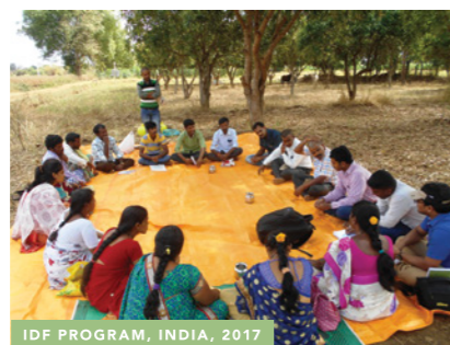
IDF PROGRAM, INDIA, 2017

In the Haveri district of southern INDIA – a transitional agro-climatic zone with low rainfall – farmers from mostly under-privileged classes with low literacy levels have little or no access to irrigation, resources and technology, and subsist on a very limited income. Our program, run in partnership with Initiatives for Development Foundation (IDF), aims to promote sustainable livelihoods for smallholder farmers through knowledge sharing, community