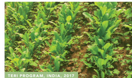
TERI PROGRAM, INDIA, 2017

In INDIA , training provided through the Foundation / TERI program has encouraged farmers to increase the proportion of land dedicated to traditional crops such as millet, with areas dedicated to highly nutritious crops increasing by 30%. The program has also allowed for a more efficient use of seeds – for reseed, self-consumption and resale – generating additional income.