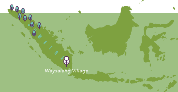
MR AMERUDIN Village of Waysalang, Lampung, Indonesia

TREES PLANTED in North Sumatra, Indonesia